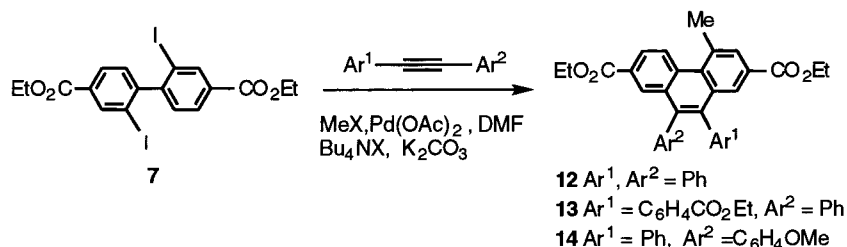
Table 2. Preparation of 4-Methylphenanthrene 12–14 by Reaction of 7 with Diarylacetylenes Using Readily Available Methyl Carboxylates as the Methyl Transferring Agents